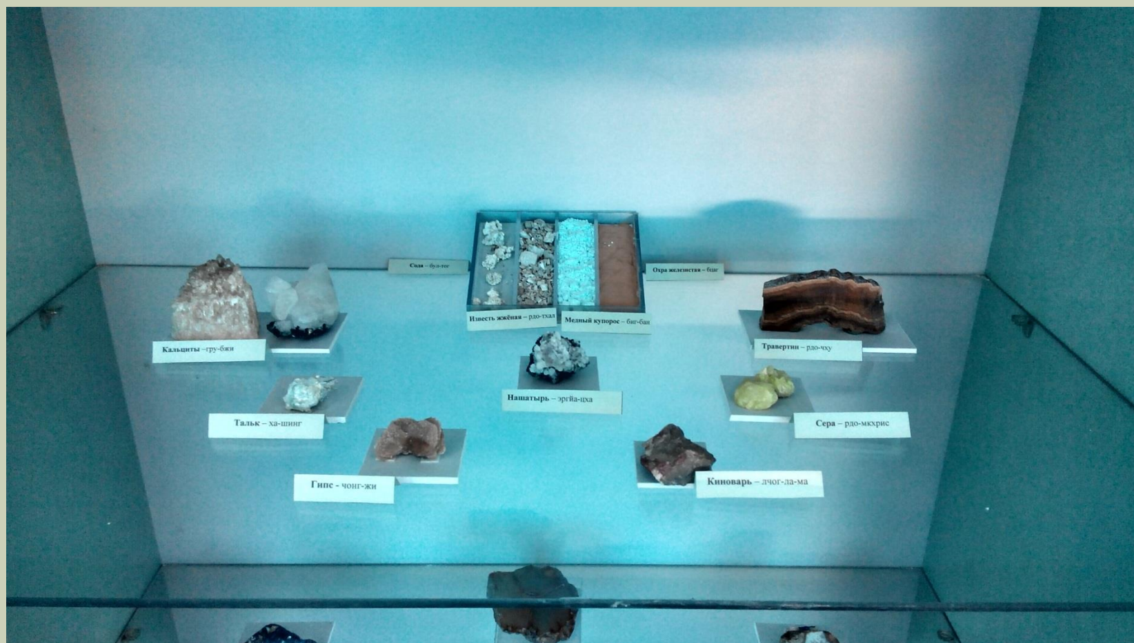
the raw materials from minerals