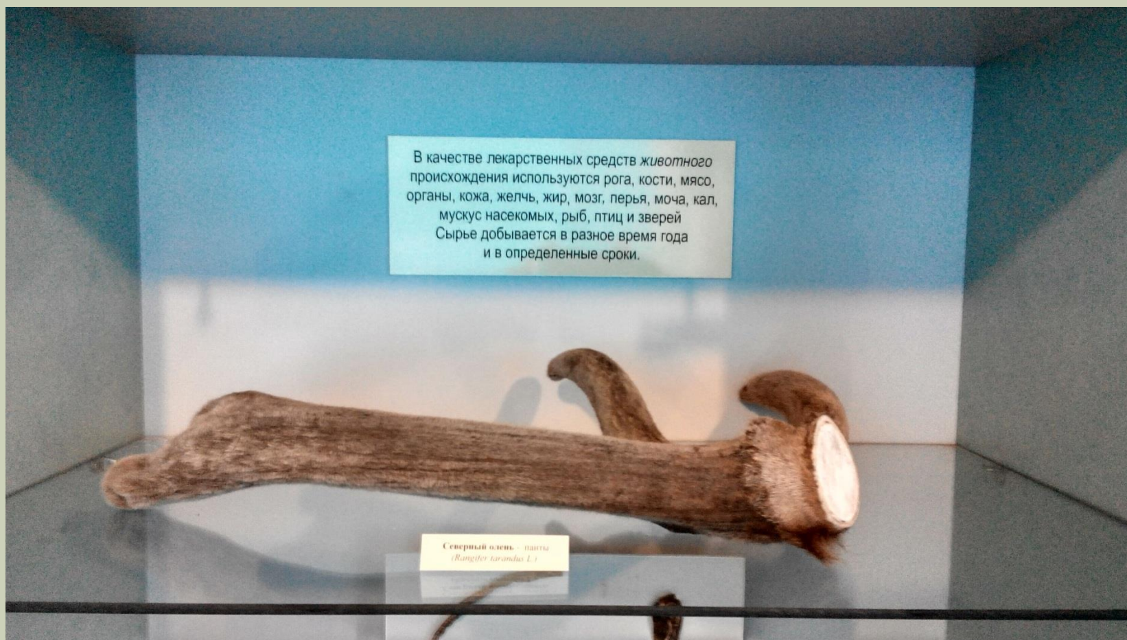
the antlers of the reindeer