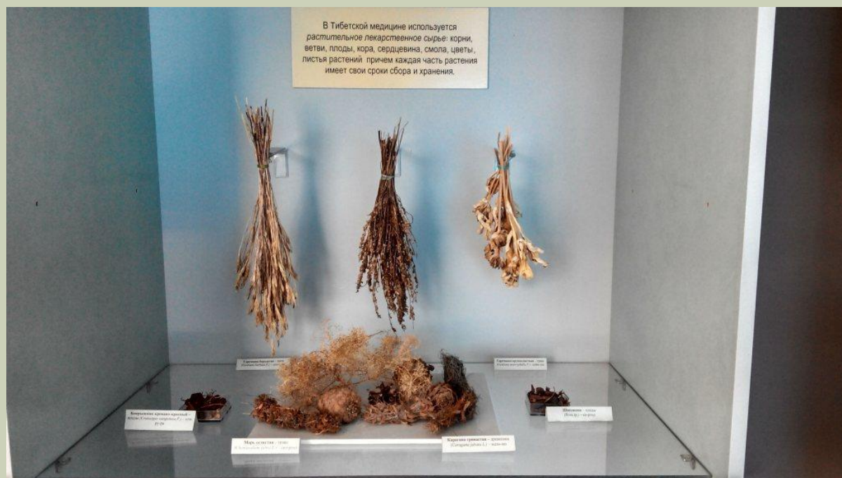
the raw materials of fito origin