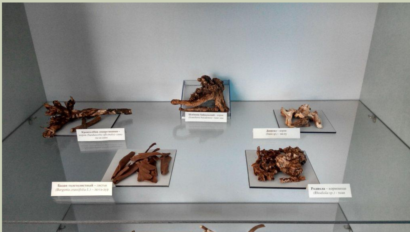
the plant roots