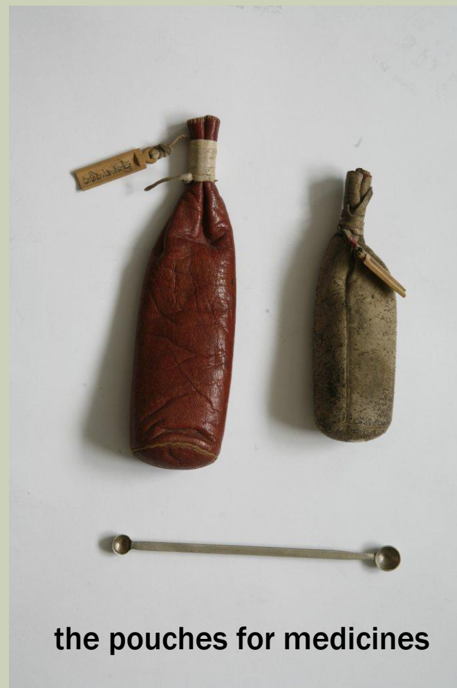
the pouches for medicines