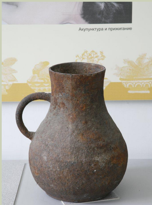
the jug for the preparation of medicines