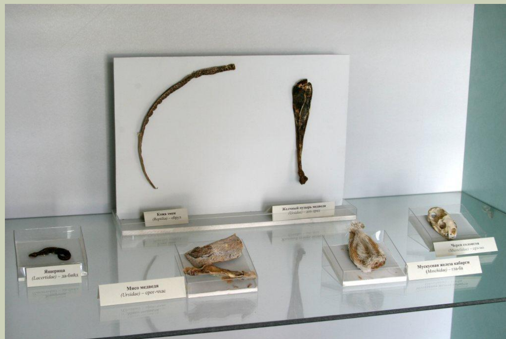
the raw materials of animal origin