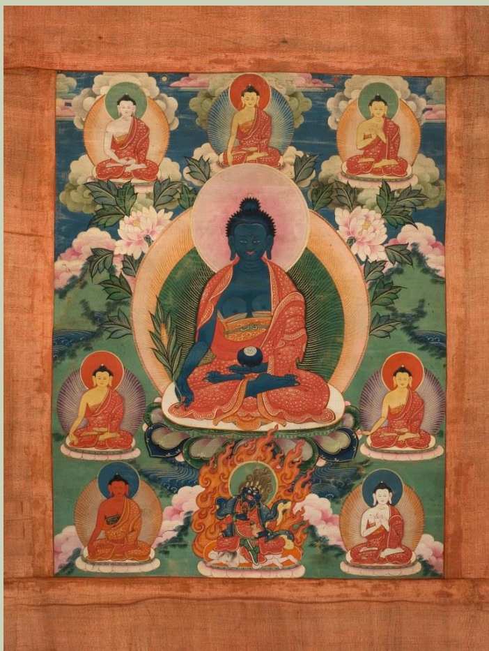
Tank of Buddha Medicine