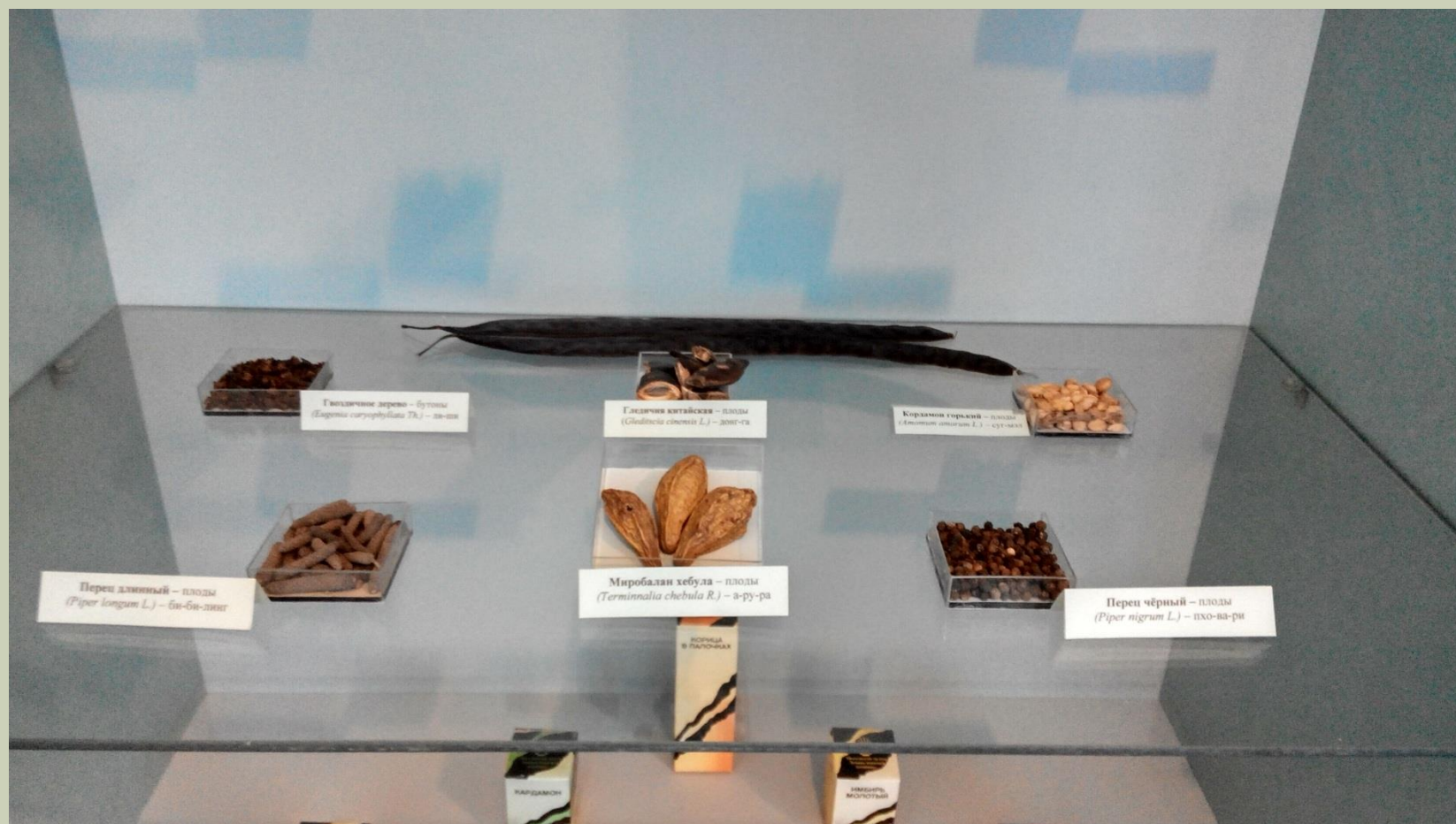
the fruits and seeds of plants